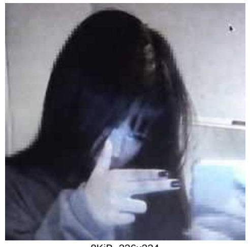
8KiB, 236x234, 036bcb60135aafdc98fbffed49514ef0.jpg View Same Google ImgOps iqdb SauceNAO

Anonymous Mon 26 Sep 2022 01:42:43 No.27756205